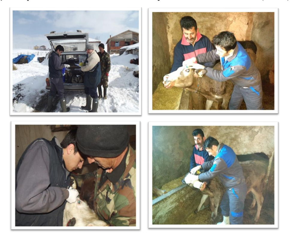
Figure 2. Çankırı province bovine brucellosis mass conjunctival vaccination studies (MoAF)