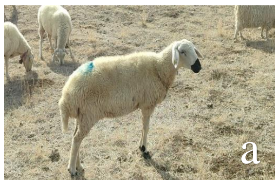
Figure 1. Akkaraman sheep (a), Lalahan genotype (b)

Sheep breeding is closely associated with the use of pasture and fallow lands, which are vital for nutrition, employment, rural development, and sociology worldwide. Sheep receive more attention than cattle due to their shorter gestation periods, higher twinning rates, lower slaughter age, and better utilization of roughage (Uysal et al., 2024). Sheep constitute a significant part of the livestock sector in Türkiye, making up about 60% of domestic animals (FAO, 2022). The majority of sheep bred in Türkiye are native breeds, with the Akkaraman breed, which accounts for 40-45% of the small ruminant population, being the most common in Central Anatolia (Şahin, 2023; Sakar, 2024). The Akkaraman sheep is a fat-tailed breed adapted to the region's harsh climatic conditions, raised for meat and milk production (Figure 1a). Lalahan sheep (Kıvrıkcık: 0.75 x Akkaraman:0.25, G1) is a genotype developed at the Lalahan International Livestock Research and Training Center (Ankara) for obtaining a new genotype suitable for steppe region conditions for lamb meat production (Erol et al., 2017). This type has a white fleece-covered body with black or brown spots on the head, face, and ears (Figure 1b).